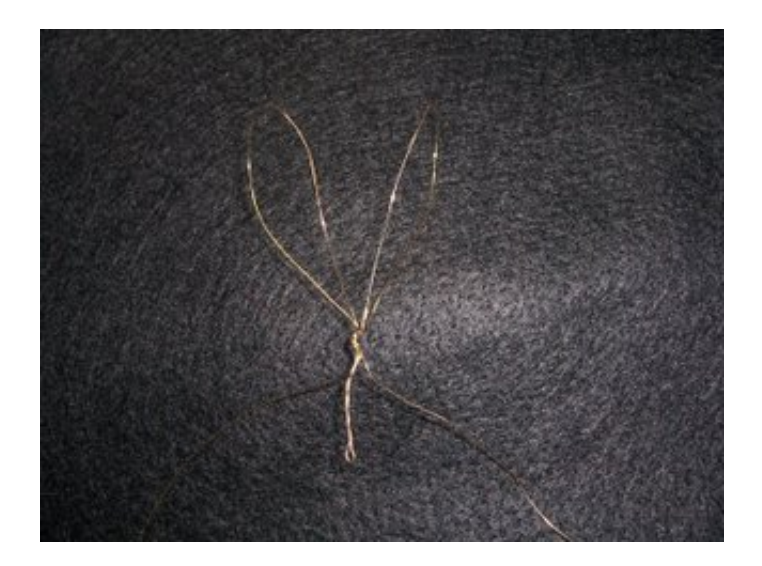
Twist wire into place.