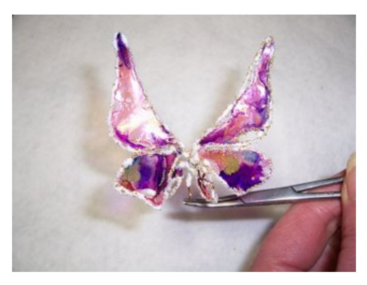
VOILA! Crispy, pose able gorgeous wings:)